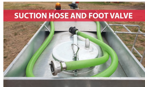
SUCTION HOSE AND FOOT VALVE

Ask us about our competitive equipment finance rates!