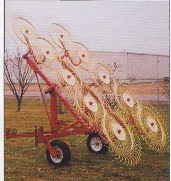
H&S V-Rake in transport position.

Warranty: See operators manual for warranty details and limitations. H&S reserves the right to change its products or the description at any time without notice or obligation. Printed in U.S.A.