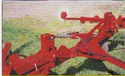
A single acting cylinder coupled with a simple linkage system allows for easy raising and lowering of rake wings.