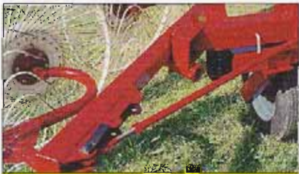
Raking width on the H&S V-Rakes can be adjusted to 3 different positions with the pin and fine tuned by adjusting the turnbuckle screw.