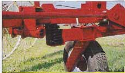
The operator can adjust the fine tune spring to allow proper rake wheel down pressure.