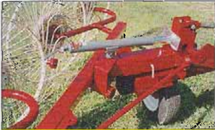
Using the hitch jack, the operator can adjust the windrow width.