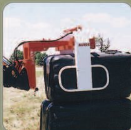
MCP lengthwise bales