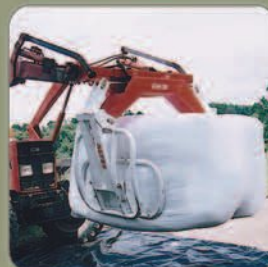
M10P120 + MB option