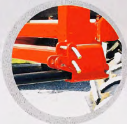
Folding tine option