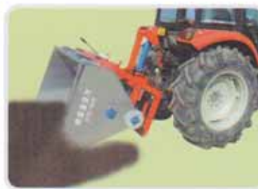
Hydraulic tip allows self loading of manure