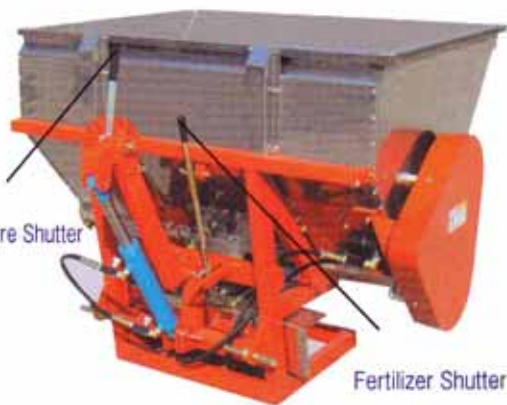
Organic Manure Shutter