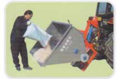
Tilt over for easy loading of fertiliser